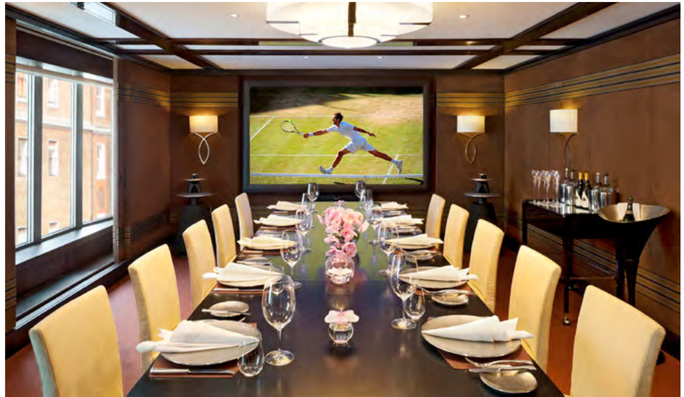
Right Media Room