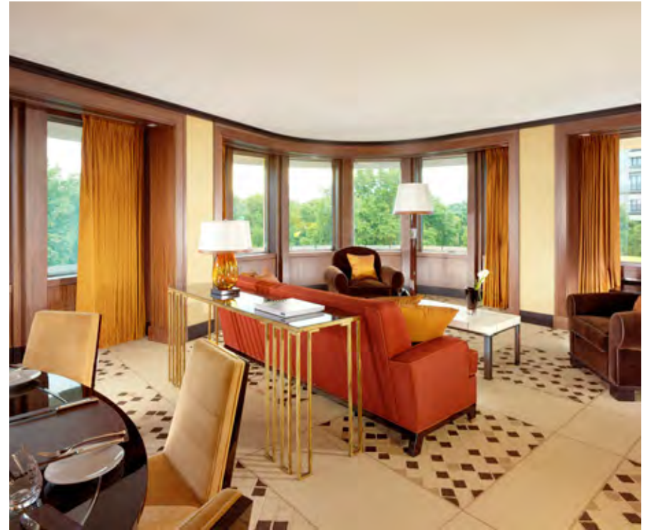
Top right Park Lane Suite sitting room Bottom right Penthouse Suite terrace Bottom left Hyde Park Suite bedroom

The Penthouse Suite is a sight to behold, with panoramic views of the London skyline and bright, airy rooms leading on to a private terrace. It features two sumptuous en suite bedrooms, a separate cloakroom, private lift and staircase access, a dining room and spacious sitting room.