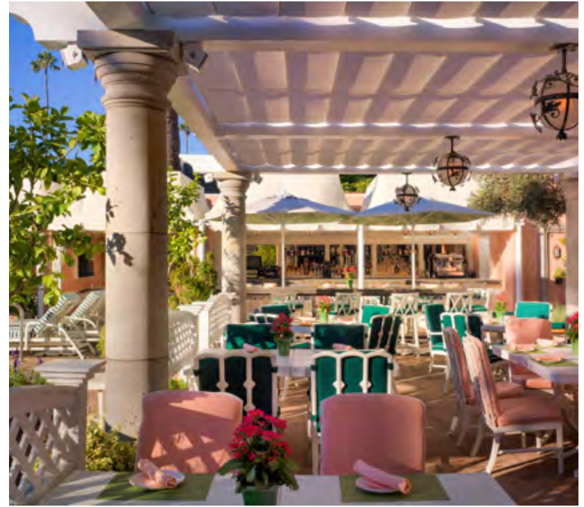
Left Polo Lounge outdoor terrace Right The Cabana Café