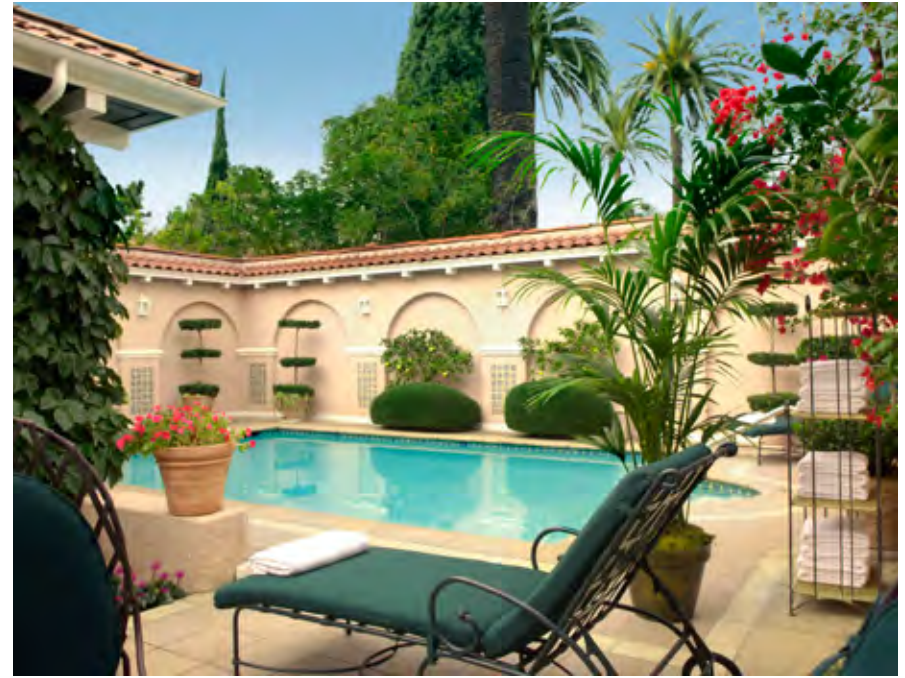
Top right Bungalow 5 private swimming pool Bottom right Deluxe Room Bottom left Presidential Bungalow living room

The two spectacular Presidential 'ultra' Bungalows are the largest and most prestigious Presidential suites in Los Angeles. Each three-bedroom bungalow blends the indoor and outdoor experience effortlessly through 464m 2 (5,000ft 2 ) of living space featuring a spacious great room with 4m (12ft) cottage-style ceiling, Chef's kitchen, expansive outdoor living area, outdoor fireplace and shower, and a wall of floor-to-ceiling glass doors overlooking a private infinity plunge pool.