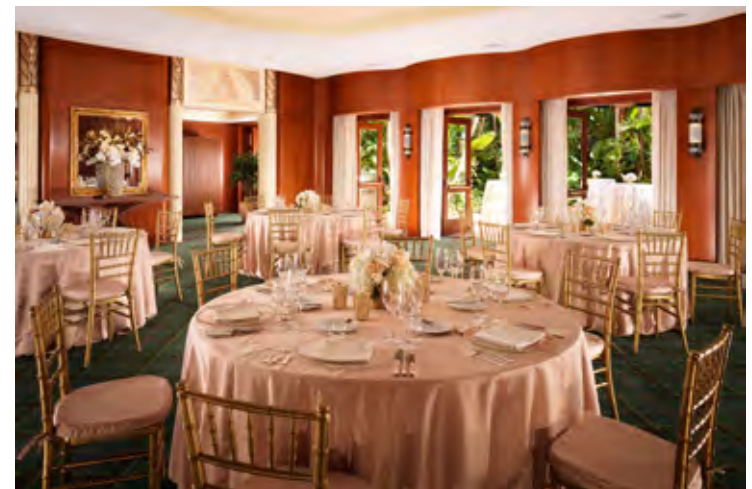
Top Crystal Ballroom Bottom right Polo Private Dining Room Bottom left Boardroom